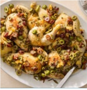
A Passover Chicken With California Cool