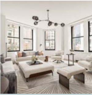
Bill Lawrence and Christa Miller List Their NoMad Condo for $7.85 Million