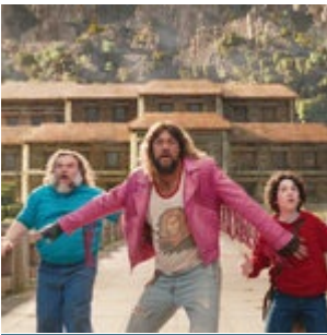
As Hollywood Courts Gamers, They Warn: 'Don't Ruin This'