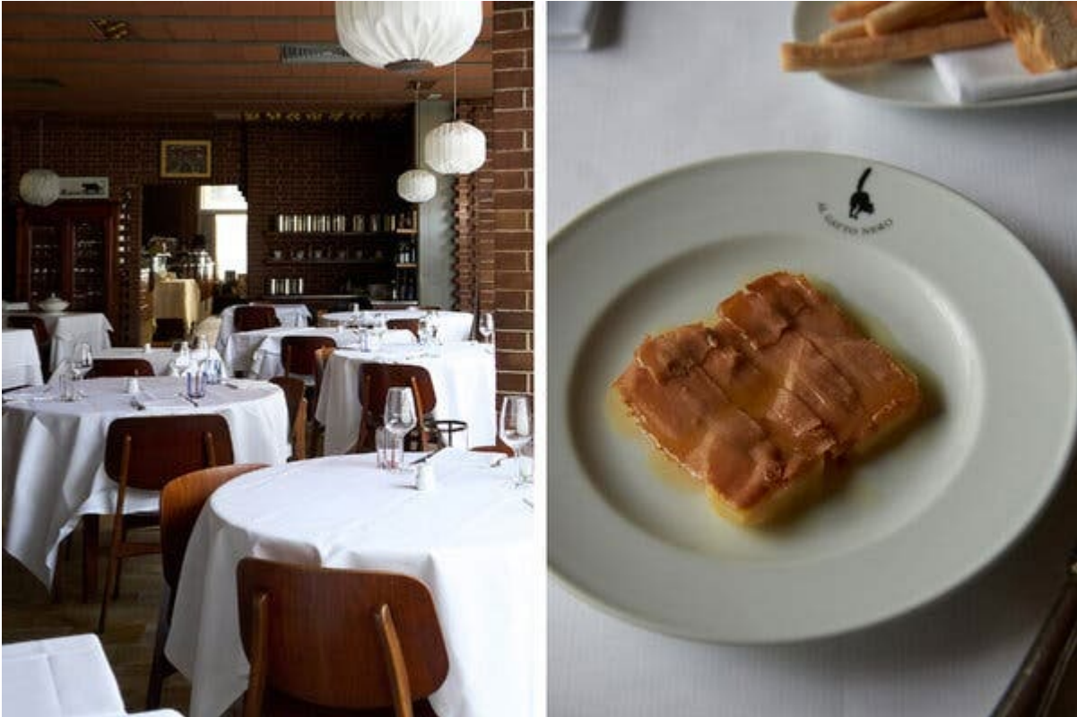
Left: Al Gatto Nero, a fixture of Turin’s fine-dining scene for the past several decades. Right: a bluefin tuna bottarga antipasto at Al Gatto Nero.

“Any guidebook would tell you to go to Del Cambio . That’s where the unification of Italy happened in 1861, because Cavour [Count Camillo Benso di Cavour, Italy’s first prime minister] had his meetings there. It’s a beautiful, antique space and [one of the dining rooms] has been decorated with mirror paintings by [the contemporary artist] Michelangelo Pistoletto. It also has one of the best wine cellars in Italy.